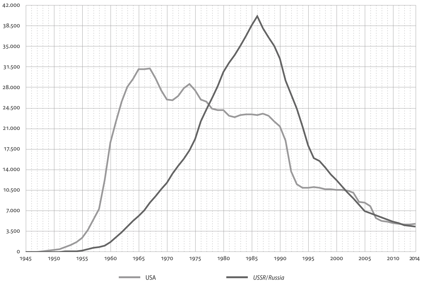
Fig. 1 Estimated nuclear warheads on the part of the USA and the USSR/Russia, 1945–2014.

to be further developed and expanded. Instead, previous achievements at both levels are now in danger of stagnation, erosion and dissolution.